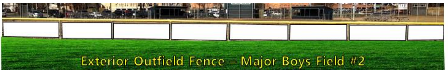
Exterior Outfield Fence – Major Boys Field #2