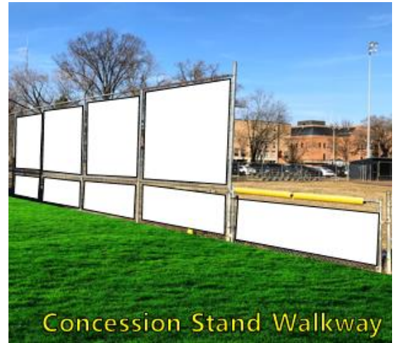
Concession Stand Walkway

Through a wide variety of sponsorships and customized advertising programs, the executive board is ready to work with you and your business to maximize the exposure that is available for your company and its business objectives. Join us in a combined effort to support a community pastime for our children and reach the vast audience that is ready to receive your company's message.